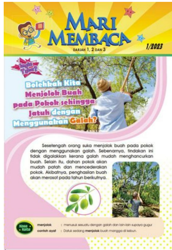
Mari Membaca Magazine