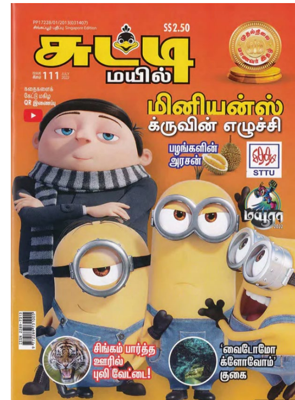
Sutti Mayil Magazine